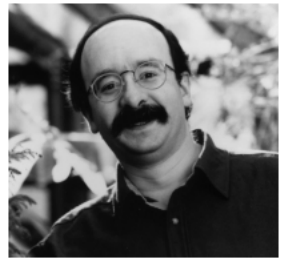
These images may be downloaded at www.naturalcapitalism.org in high or low resolution format for publication.

Amory Lovins is renowned for his wide-ranging intellect and unique problem-solving approach, which he has used to make major breakthroughs in fields ranging from automobiles to energy. His work has consistently focused on harnessing market forces to promote resource efficiency as a solution to a variety of social, economic, and environmental problems.